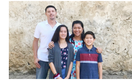
MEET THE PEOPLE