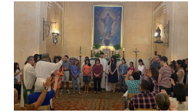
BACK TO SCHOOL BLESSING